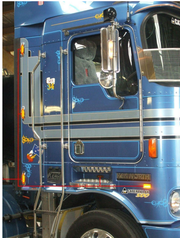
Side-marker lamps or non-specified (cosmetic) lamps?

Yes it may providing it meets all condition and performance requirements for side-marker lamps as set out on page 4-8-1 of the in-service VIRM.